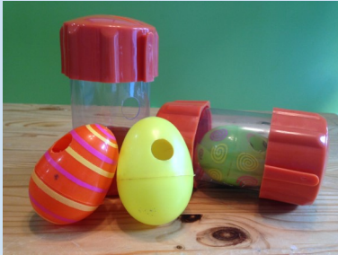
Some examples of rolling food puzzles.

Food puzzles are an excellent way to increase your cat's activity and mental health by giving them a new, more natural way to get their food by "hunting" for it. Food puzzles typically come in two styles, rolling and stationary. They can be purchased or homemade, and can be used with dry or wet food, or treats.