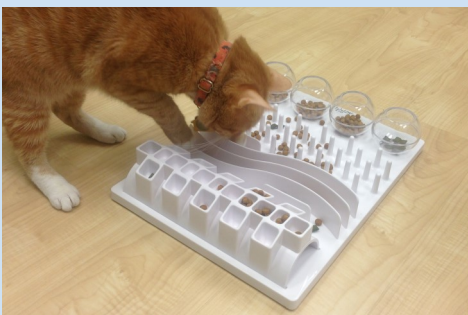
Stationary puzzles can be used with wet and dry food.

For slow starters , place small handfuls of dry food in locations frequented by the cat (condos, window sills, beds.). This allows the cat to discover food in novel places.